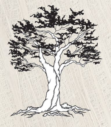
The branches grow because of the trunk. A Great Way to Love Kohala Forever

KA LALA ULU Rooted in our mission to support successful community projects, we build on the aspirations and visions of a vibrant and thriving community enriched by its people. To ensure this vision, our goal is to enhance our ability to respond to a sometimes quickly changing world while still providing the grassroots support that has served the community well for 20 plus years. Your support of the Center's operations through our Planned Giving endowment program will help ensure that future generations benefit from our simple and financially prudent, yet enduring, model of community support.