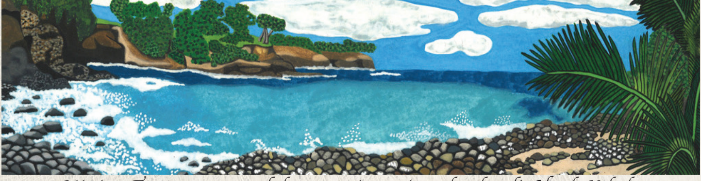
Mission: To support successful community projects that benefit North Kohala