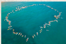
MALCOLM DAVIS MEMORIAL FUND