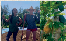
ROGUE PANDA FARMS