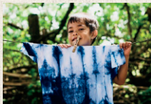
GIVE AND GROW DISCOVERY SCHOOL