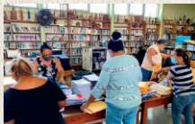
KOHALA 'OHANA SUPPORT AND WELLNESS INITIATIVE