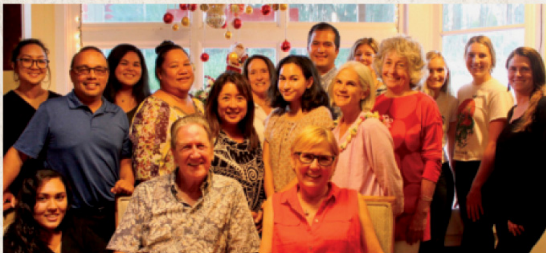
NKCRC Board of Directors and Staff, December 2019