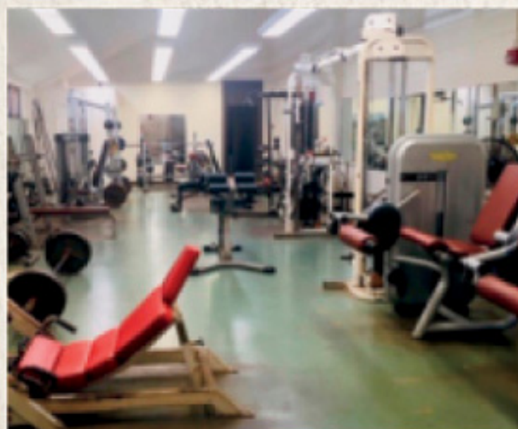
KOHALA WEIGHT LIFTING CLUB