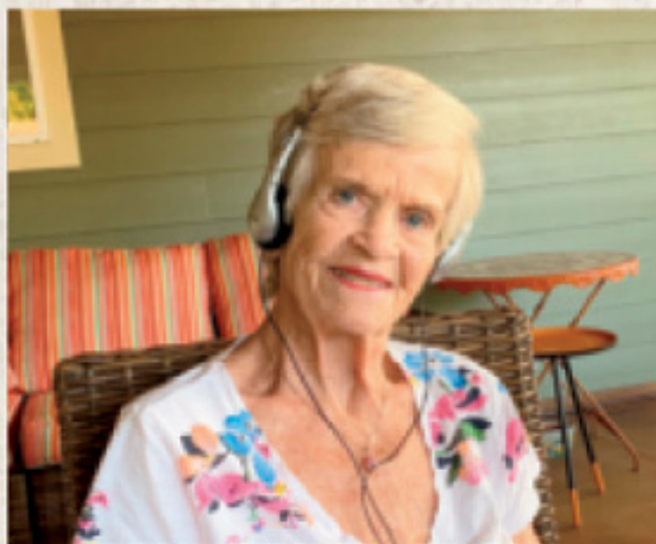
REMEMBER THRU MUSIC