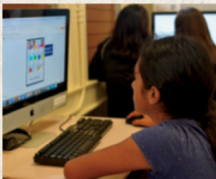
KMS 21ST CENTURY LIBRARY