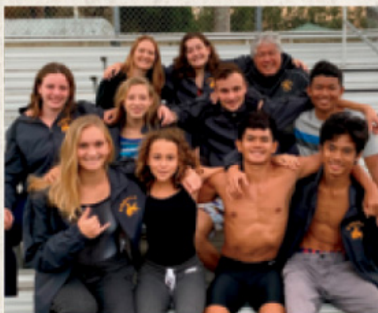
SUITS AND SEATS FOR SWIMMERS