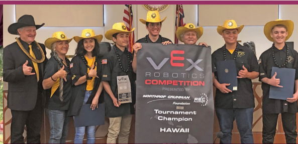
KHS ROBOTICS PROGRAM