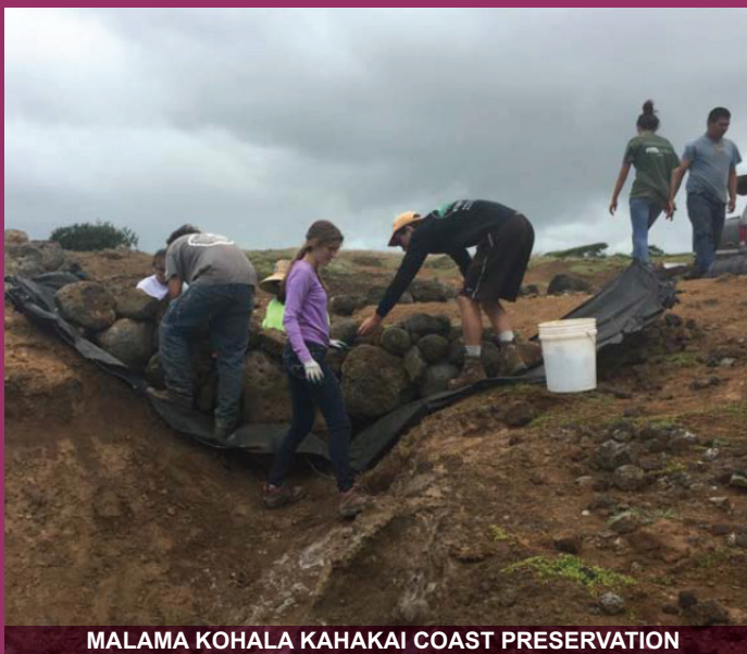
MALAMA KOHALA KAHAKAI COAST PRESERVATION