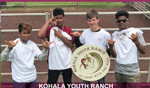
KOHALA YOUTH RANCH