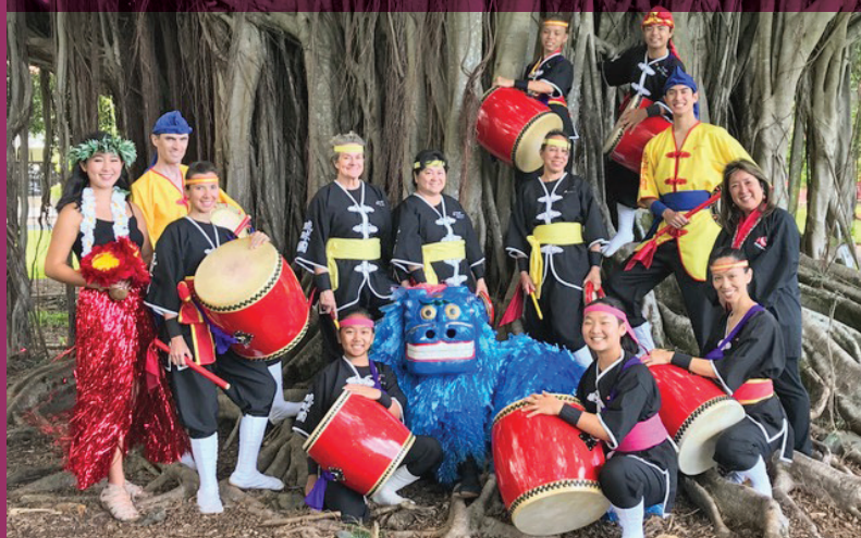
RYUKYUKOKU MATSURI DAIKO KOHALA