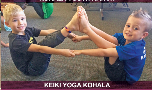
KEIKI YOGA KOHALA