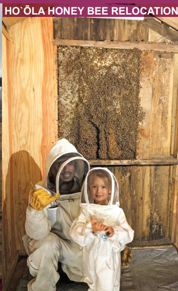
HO'ŌLA HONEY BEE RELOCATION