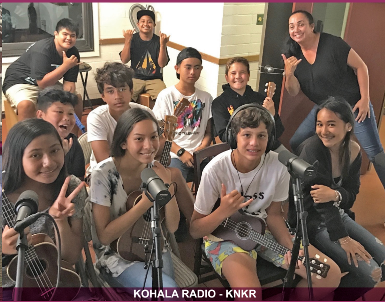
KOHALA RADIO - KNKR