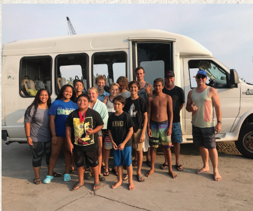
KAWAIHAE CANOE CLUB KOHALA KEIKI VAN