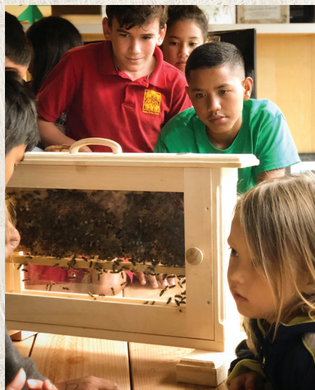
HO'OLA HONEY BEE RELOCATION'S IN-SCHOOL PRESENTATION

The workshops are free to organizers of projects that have been accepted for fiscal sponsorship. Participants without our sponsorship may attend on a fee basis. Classes are held at our office on Akoni Pule Highway in Hawi. Please call the Center for more information or to register, 889-5523.