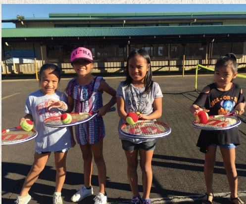
KOHALA ELEMENTARY TENNIS PROGRAM