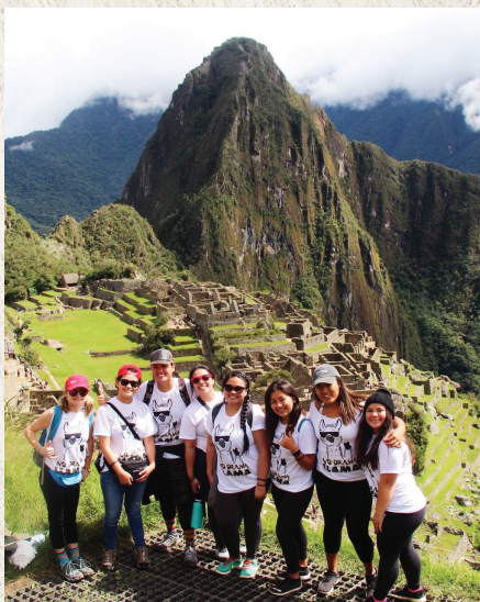
EXPERIENTIAL LEARNING ABROAD'S 2018 TRIP TO PERU