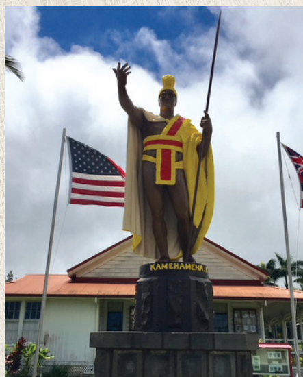
KING KAMEHAMEHA STATUE RESTORATION