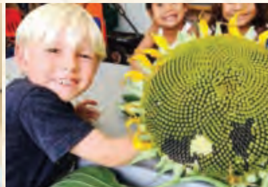
KES Discovery Garden