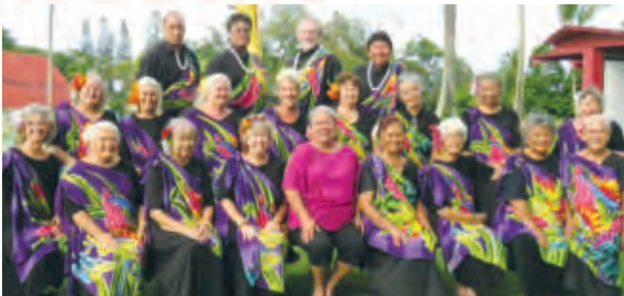
Na Kupuna O Kohala Hula Halau