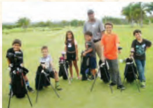
Kohala Golf Park