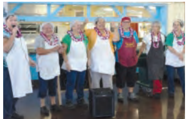
Kohala Farm 2 School