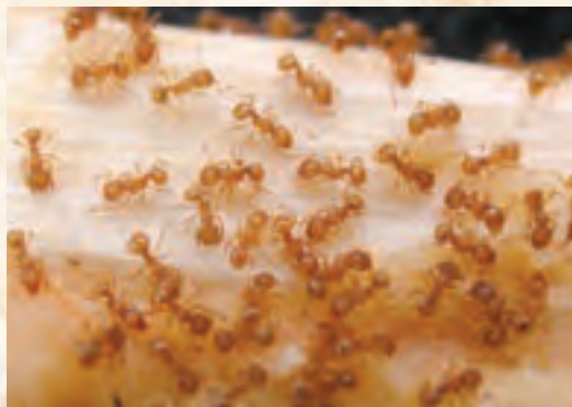
Stop LFA Kohala