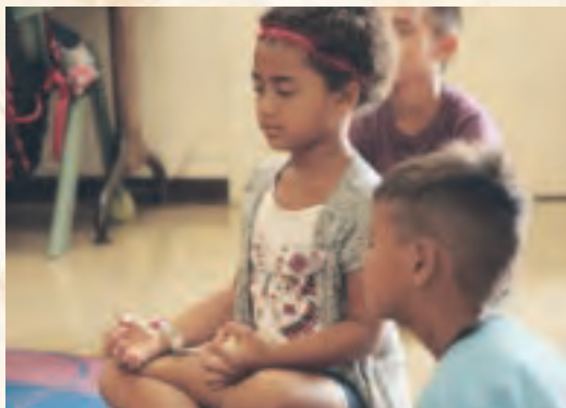
Keiki Yoga Kohala