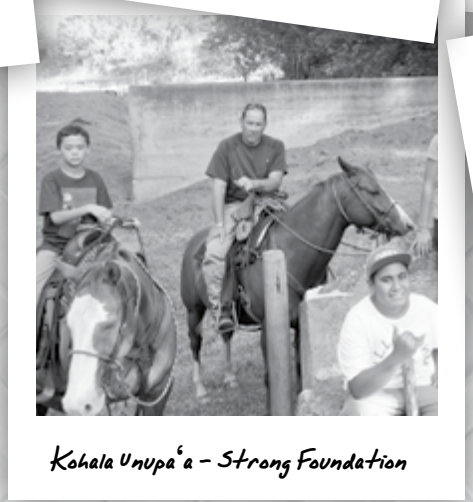
Kohala Unupā'a - Strong Foundation