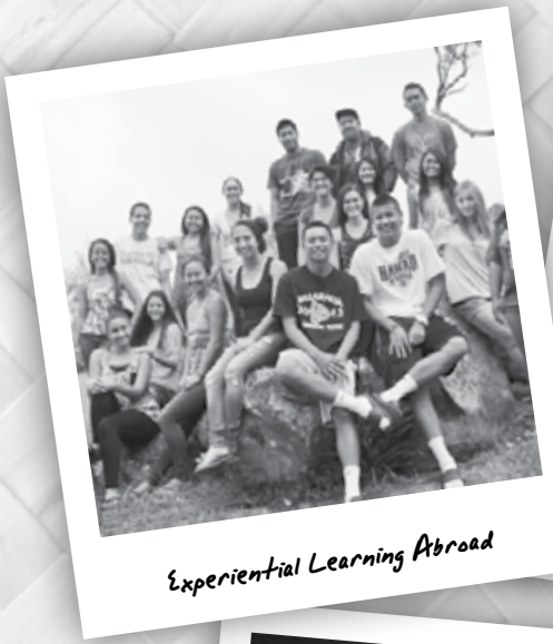
Experiential Learning Abroad