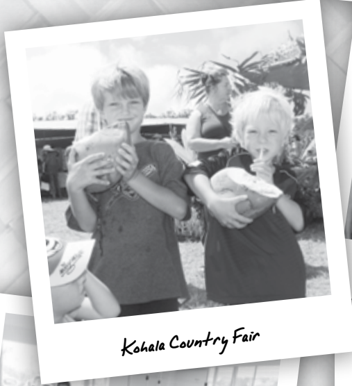
Kohala Country Fair