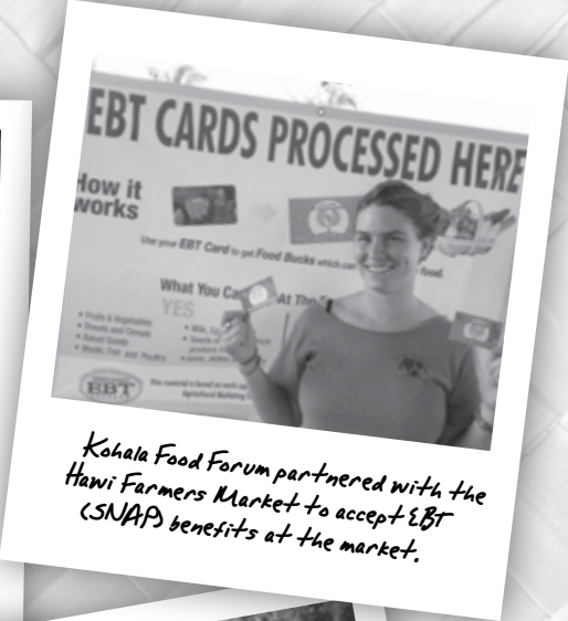
Kohala Food Forum partnered with the Hawi Farmers Market to accept EBT (SNAP) benefits at the market.