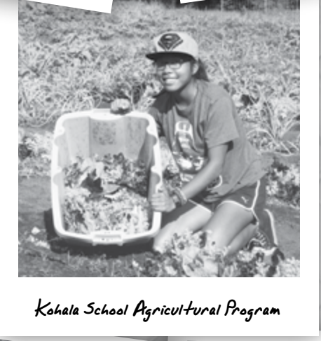
Kohala School Agricultural Program