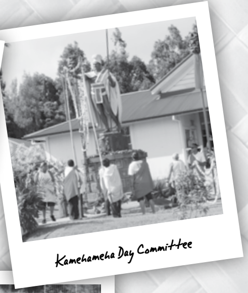
Kamehameha Day Committee