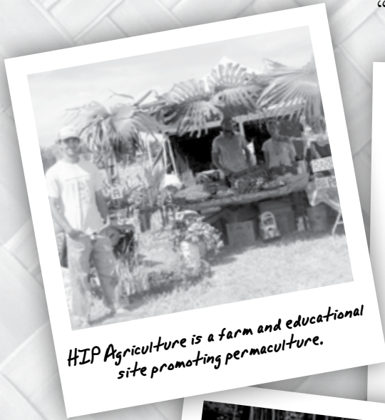
HIP Agriculture is a farm and educational site promoting permaculture.

Of our 83 current projects, 16 are farms or groups that work to promote agriculture in North Kohala and help the community attain its goal of producing 50% of our own food by 2018. Here are some of our most active agriculture projects that help “Keep Kohala, Kohala.”