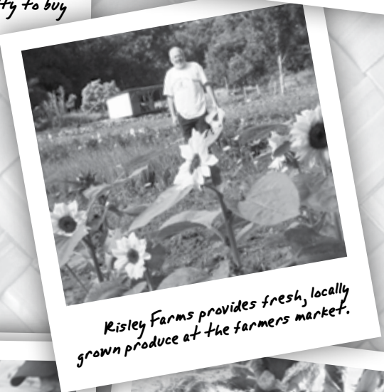
Risley Farms provides fresh, locally grown produce at the farmers market.