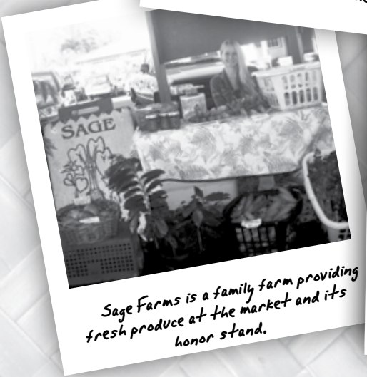
Sage Farms is a family farm providing fresh produce at the market and its honor stand.