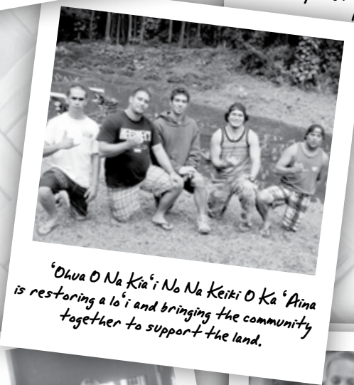
'Ohua O Na Kia'i Na Na Keiki O Ka 'Aina is restoring a lo'i and bringing the community together to support the land.