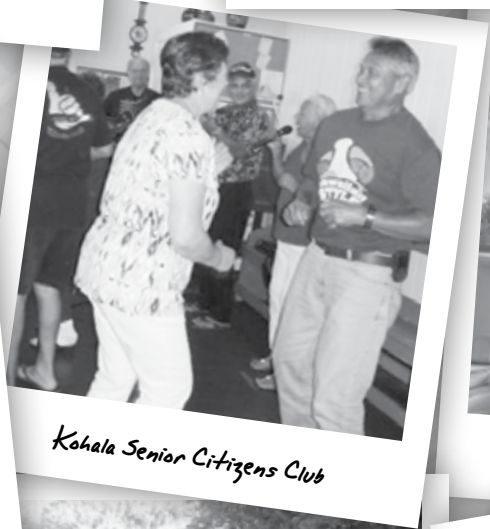
Kohala Senior Citizens Club