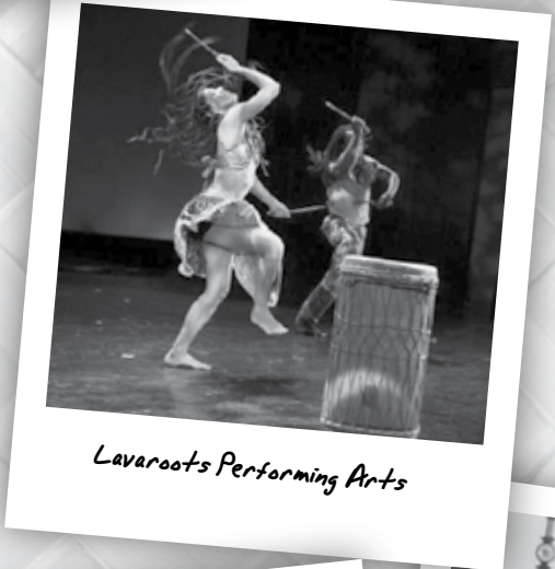
Lavaroots Performing Arts