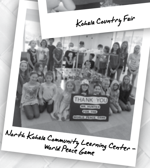
North Kohala Community Learning Center - World Peace Game