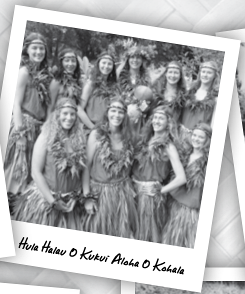
Hula Halau O Kukui Aloha O Kohala