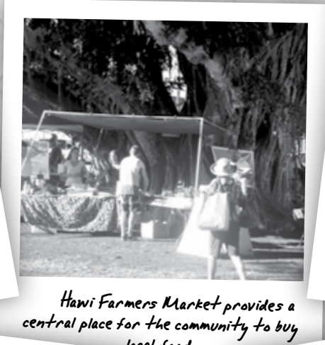
Hawi Farmers Market provides a central place for the community to buy local food.