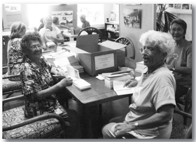
Our volunteers at work