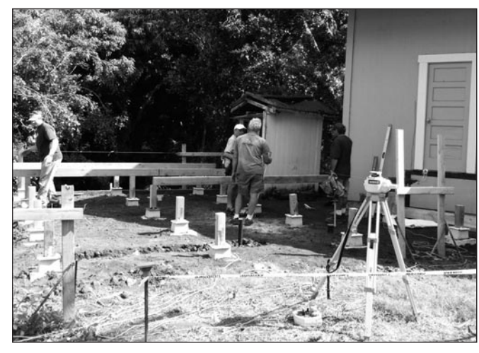
New public rest rooms open this spring