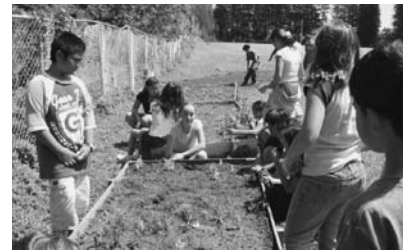
KES garden, May 2006