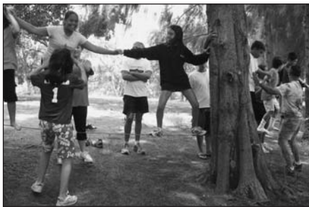
Project Venture Summer Camp