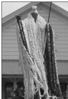
King Kamehameha Statue

It's January and that signifies that it is time for the twice annual maintenance of our beloved ki'i. The team of volunteers will wash and inspect the King from head to toe and note all findings for the record and the